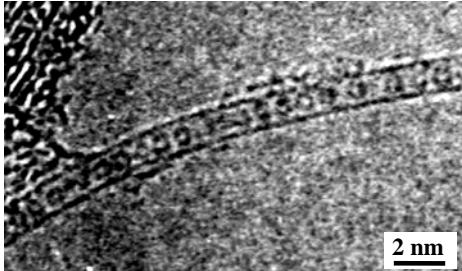
Fig. 2 TEM image of Gd@C<sub>82</sub> peapods.